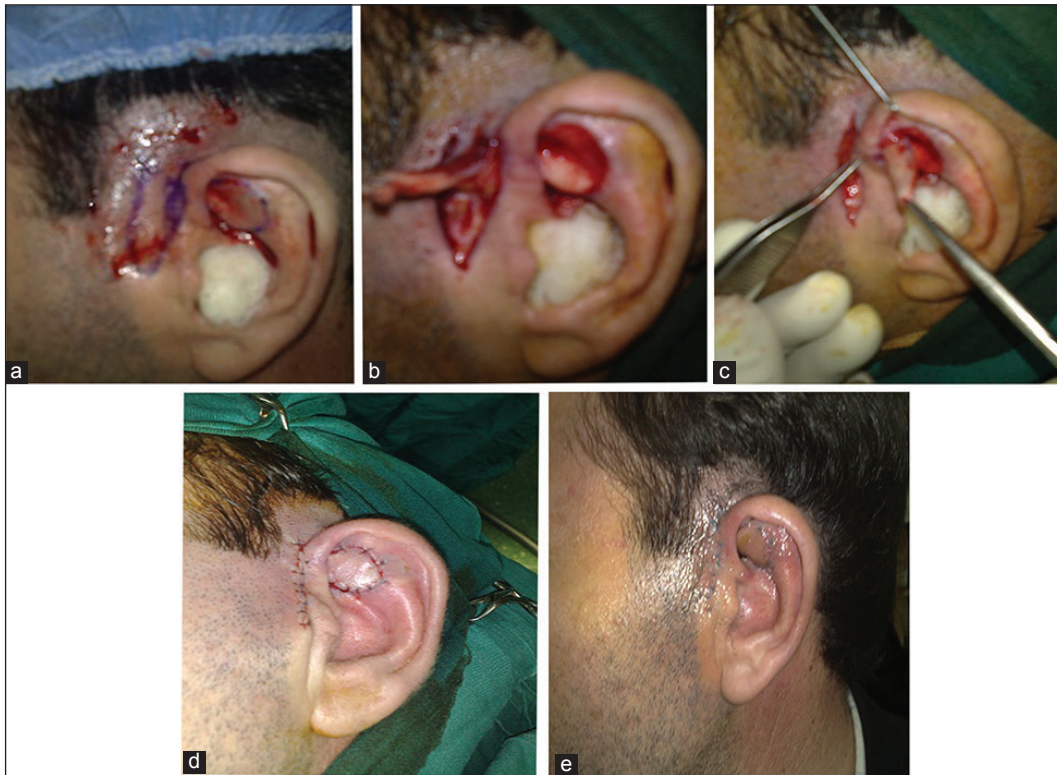
Figure 2: (a) Before operation designing of preauricular pull-through flap (b and c) Intraoperative view of flap (d and e) 1-month postoperative view of flap. In this figure, the stages of flap designing and ear reconstruction are shown

posterior defects, postauricular design is suitable and in anterior defects between the antihelix crura preauricular design was better. This is a single-stage operation. Donor site of flap in both areas closed primarily and it was hidden in the postauricular or preauricular area; the size of tunnel was a little larger than the width of flap in the base. The thickness of the flaps was similar to the thickness of the defects.