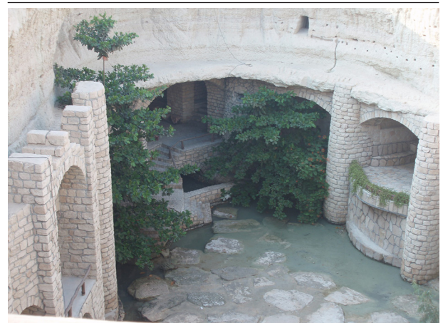
Figure 4. Kish Underground City

The Greek shipwreck, located just off the beach on Kish's south-west coast, is a 1943 cargo steamship, called the Koula F (8). It was originally a British ship, the Empire Trumpet, and was built in Scotland (8). She ran aground