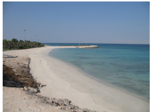
Figure 5. The Beach of Kish

in 1966 and all attempts to salvage it failed (8). When the Koula F's crew abandoned the ship they set it on fire, and all that remains is a steel hull (Figure 3).