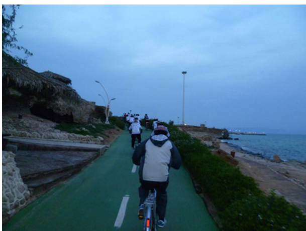
Figure 7. Asphalted Two-Way Bicycle Road on the Shoreline Encircling the Island of Kish