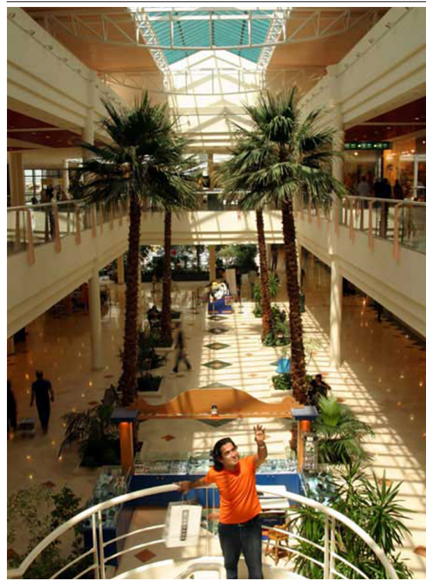
Figure 1. Paradise Shopping Mall in Kish

It is a free trade zone touted as a consumer's paradise, with numerous malls (Figure 1), and shopping centers.