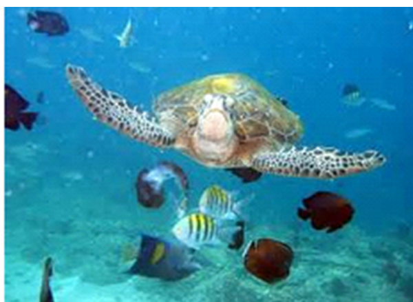
Figure 6. A) Diving in Kish, B) Colorful Exotic Marine Life Near the Shores of Kish