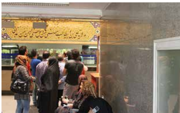
Figure 3. Alghadeer Hospital, Tehran-Emergency Department-Note Disproportion Between the Reception Space and Referrals

In general, comprehensive studies on all the issues of physical environments of the country's healthcare buildings are sparse. Many of the findings in the present study are in accordance with other existing studies. For example, the necessity of improving the safety and security of the physical environment of hospitals for crisis and