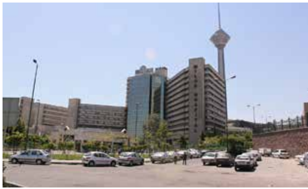
Figure 2. Milad Hospital, Tehran- Note Lack of Landscape