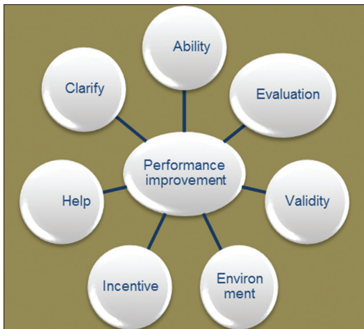
Figure 1: The variables of achieve model