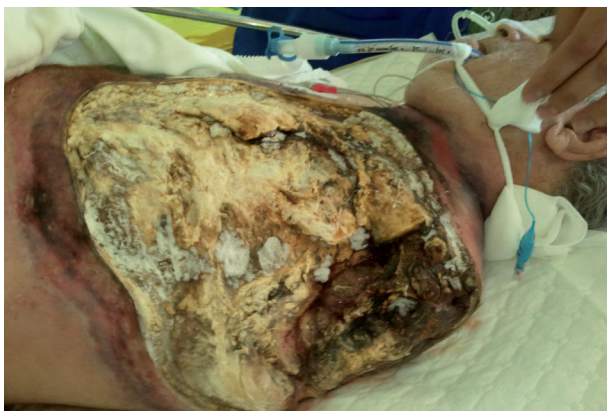
Figure 3. Progression of necrosis despite limb amputation.

When the diagnosis of necrotizing fasciitis is established, urgent exploration and debridement is imperative. Intravenous antibiotic should be administered empirically as soon as possible. This medication should have a broad antimicrobial spectrum, and should cover likely pathogens (14). Intravenous immunoglobulin (Ig) has been used as well in the treatment of necrotizing fasciitis and sporadic reports have demonstrated reduced mortality in patients receiving IV Ig (4). In most cases repeated debridement is mandatory. All necrotic tissue must be excised and surgical incisions should be generous in order to extend beyond the necrotic area (15). Am-