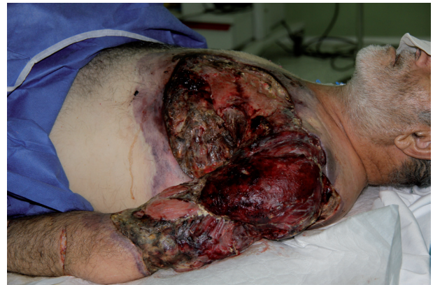
Figure 2. Extent of necrosis.