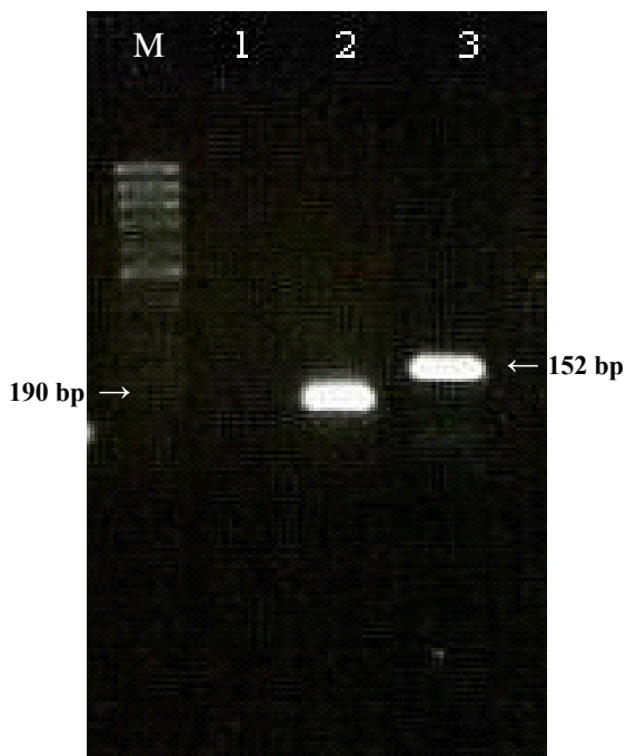
Fig. 2. Identification and subtyping of avian influenza viruses in cloacal and tracheal swabs samples. Lane M, size markers (50 bp ladder, CinnaGen, Iran) lane 1, H 2 O control and lanes 2 and 3, ten \mu l of RT-PCR products obtained by using primers specific to HA genes of the H5N1 and H9N2 viruses product was applied on a 2% gel. The sizes of RT-PCR HA gene product are indicated by arrows.

by the multiplex RT-PCR with primer set present (Fig. 3). The specific products could be clearly separated and identified on a 2% agarose gel. The multiplex RT-PCR was performed on both avian and tracheal swabs for detection of H9 and H5 subtype. Twenty nine out of 98 (29%) cloacal swabs and 11 out of 49 (22%) tracheal swab samples contained influenza A virus H9 subtype. No detectable PCR products were seen for influenza A virus H5 subtype. Nucleic acid extraction and multiplex RT-PCR amplification from 26 human clinical samples (nasopharyngeal aspirate or nose and throat swabs) did not show any PCR product.