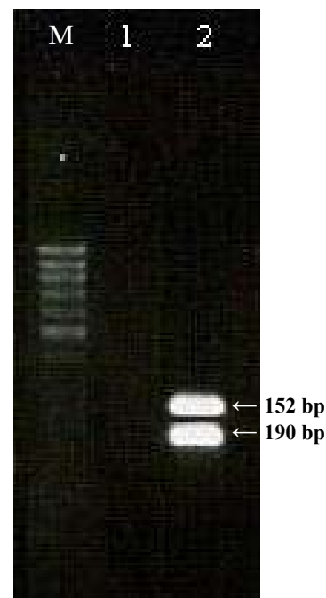
Fig. 3. Subtyping of avian influenza viruses in cloacal and tracheal swabs samples. Lane M, size markers (50 bp ladder, CinnaGen, Iran) lane 1, H 2 O control and lanes 2, ten \mu l of Multiplex RT-PCR products obtained by using primers specific to HA genes of the H5N1 and H9N2 viruses. The sizes of RT-PCR HA gene products are indicated by arrows.

To diagnose influenza, culture confirmation is a well-established laboratory technique and remains as the standard method in most clinical laboratories. Culture conformation is a combination of cell culture-based virus isolation (VI) and subsequent immunostaining; however, the requirements of maintaining tissue culture cells and infectious virus particles represent drawbacks in obtaining timely and consistent results [19]. Moreover, VI can detect only live virus; therefore the viruses inactivated during shipping or by disinfectants (which may be present in environmental samples) may be detected