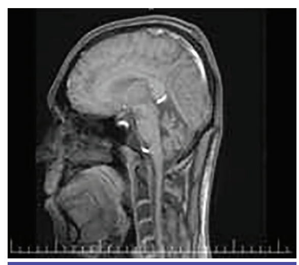
Figure 1: Brian MRI of the proband with cerebellar atrophy.

The HA are a genetically heterogeneous group of disorders which are difficult to separate clinically as they are all diagnosed with poor motor coordination arising from a malfunction of the cerebellum and its connections.<sup>3</sup> Based on the Mendelian modes of inheritance, the HA are classified as autosomal recessive, autosomal dominant, and X-linked.<sup>1</sup> The prevalence of the autosomal dominant cerebellar ataxias is reported to be 1-5:100,000 population. The prevalence of the autosomal recessive type of HA is roughly estimated to be 3:100,000 with ataxia-telangiectasia, Friedreich ataxia, and