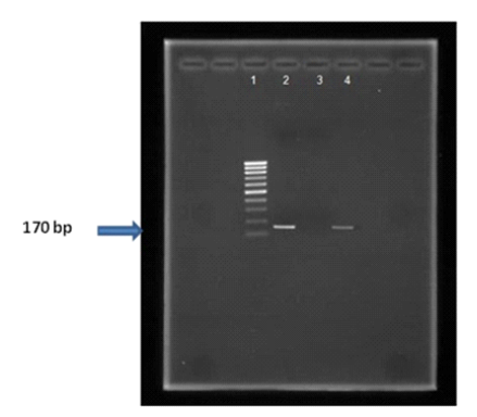
Fig. 1. PCR characterization for Lactobacillus acidophilus . 1: marker, 2: positive control, 3: negative control, 4: unknown sample