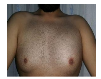
Figure 1. Patient's image reveals the apparent left breast and chest wall enlargement

The patient was a 30-year-old male that was admitted to our department due to gradually left breast enlargement during the previous 5 months ago. He was referred for surgery as gynecomastia three months ago, but the patient did not return for treatment. After 5 months, he came with a pale appearance and a large tense left breast lump measured about 10×10 Cm (Figure 1).