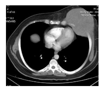
Figure 2. Chest CT scan revealed a left chest wall mass (mediastinal view)

A spiral chest CT scan was performed for further evaluation and revealed a solid round mass in the left anterior chest wall (Figure 2,3).