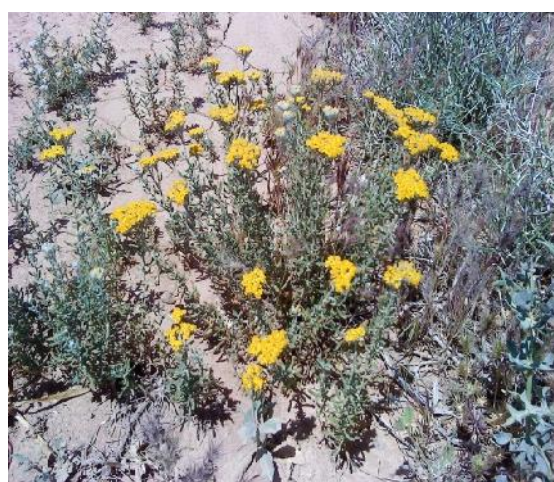
Fig. 1. The plant Achillea vermiculata in its natural habitat, Armand district in Chaharmahal and Bakhtiari Province, south-western of Iran (original)

We did not observe any significant differences between ED 50 and ED 90 of S. hortensis and A. vermiculata by T-test and P > 0.001 analysis.