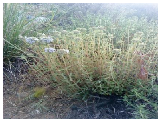
Fig. 2. The plant Satureja hortensis in its natural habitat, Sheyda district in Chaharmahal and Bakhtiari Province, south-western of Iran (original)