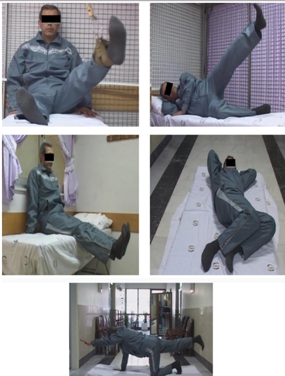
Figure 2. Images From the Video Clips of Functional Activities in Groups 1 and 3 (Original Pictures)

Patients in groups 1 and 3 were seated in front of a 25-inch monitor at 2 m distance and watched the functional movie. After watching, they tried to imitate the same movements on the movie. A total of 29 silent video clips (to stimulate only the visual sensation) of movements routinely used for physiotherapy of hemiparetic patients were shown to groups 1 and 3 in the form of separate 1-minute clips with 5 repetitions (Figure 2). Clips started with the simplest to the most difficult movements and 3 clips were shown per session. The process of showing the movies was based on the patient's ability and started with simple movements towards more difficult and complex ones.