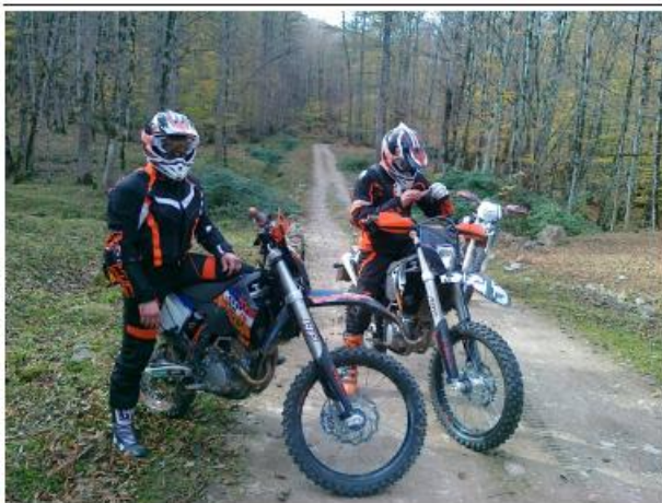
Figure 4. Two Trauma Surgeons Exploring the Wilderness and Woodlands of Kelard Dasht Northern Iran While on Vacation; Trail Riding and Hill Climbing