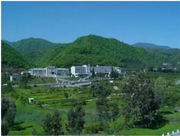
Figure 16. Ramsar Hotel Resort Nestled in the Mazandaran Mountains.