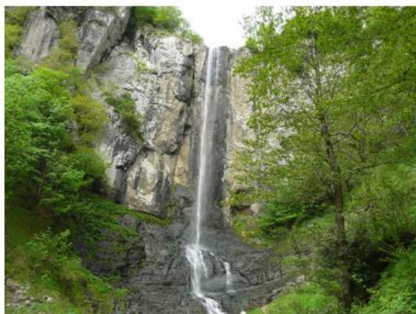
Figure 13. Lawton Falls in Gilan, Iran