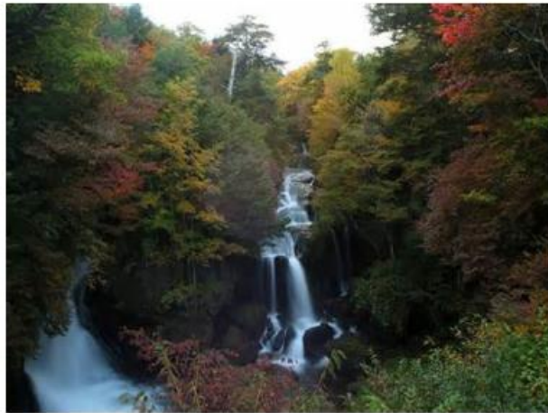
Figure 11. Beautiful Waterfalls Near Chalous City, Iran