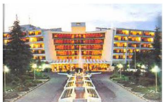
Figure 15. Azadi Hotel at Dusk