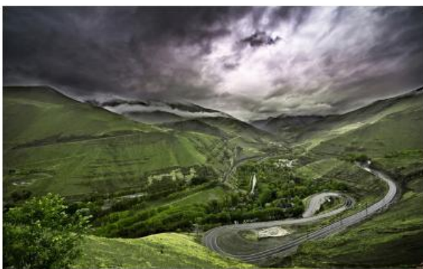
Figure 9. The Spectacular Chalous Road in the Summer ( http://karim-khanzand.com/detail/88 )

most scenic, without a doubt, is the road to the northern city of Chalous known as the Chalous Road. This