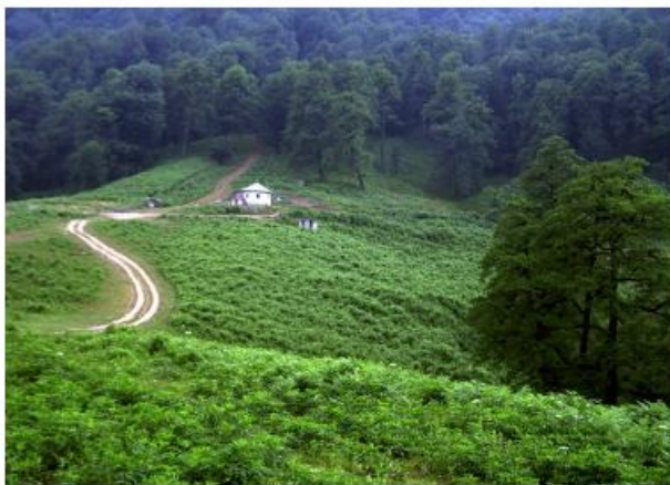
Figure 3. The Mountainous Region of Ramsar with Beautiful Foothills of the Alborz Mountain Range, Covered With Dense Forests and Meadows. The Lush Green Forestry and Calm Are Perfect for Relaxation ( http://www.irantourcenter.com/Mazandaran/default.aspx )