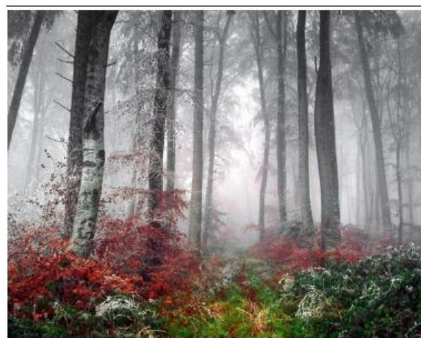
Figure 1. Dense Misty Forest With a Calm, Peaceful and Serenic Atmosphere - Perfect for Hiking

Back to nature: The Gilan and Mazandaran, provinces have beautiful dense forests and national parks that are ideal for camping, hiking and biking; the beauty and solitude is euphoric (Figures 1-4).