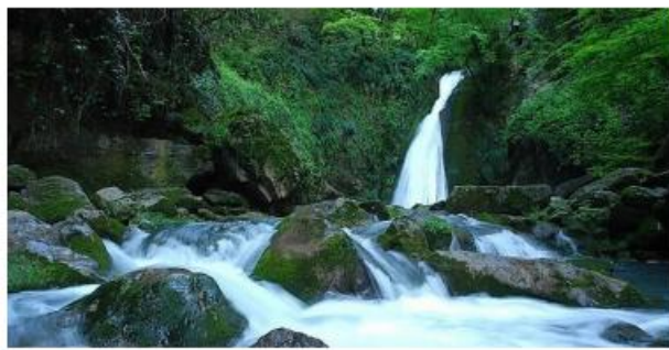
Figure 12. Beautiful Waterfalls in Shir-Abad, Golestan Province, Iran