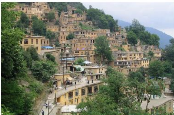
Figure 18. City View of Masuleh ( http://en.wikipedia.org/wiki/Masuleh )