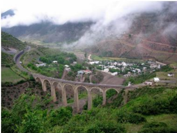
Figure 17. Mazandaran Savad Kooh Bridge