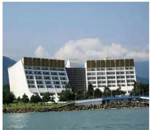
Figure 14. Azadi Hotel Overlooking and Bordering the Caspian Sea ( http://www.southtravels.com/middleeast/iran/caspianazadi/index.html )

The northern provinces also have fine museums, parks, restaurants, and striking architectural landmarks and monuments (Figure 17). The city of Masuleh has a unique architecture and is surrounded by forests from valleys to peaks. Masuleh is a city in the Sarda-r-e Jangal District of Fuman County, Gilan, Iran. Masuleh is approximately 60 km southwest of Rasht and 32 km west of Fuman (Figure 18).