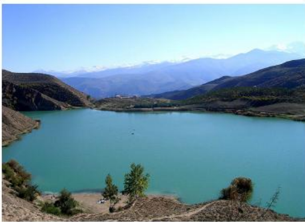
Figure 8. The Splendid Valasht Lake