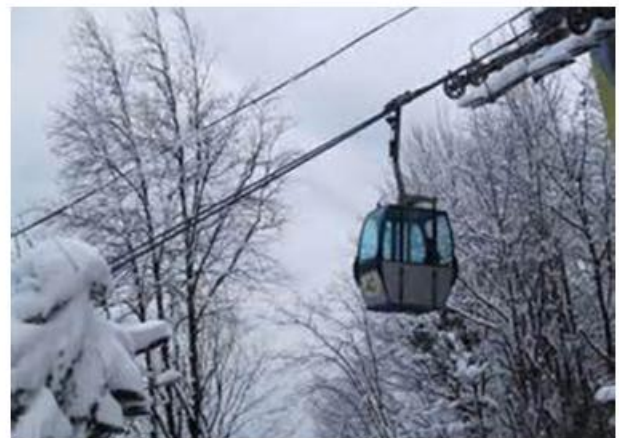
Figure 6. Namak Abroud Cable Car Ride in the Winter