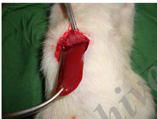
Figure 1. Extracting the Liver Lobe from the Abdominal Cavity

The rats were anesthetized by kethamine (10 mg/kg). Then the cutaneous and subcutaneous layers in the abdominal zone were opened, and after determining the anatomical position of the liver, the liver lobe was extracted from the abdominal cavity (Figure 1). Next, a two-centimeter long and half-a-centimeter deep cut was made on the liver by a scalpel (the depth was determined by a mark made on the scalpel half a cm from the tip, and the length was measured with a ruler on the liver).