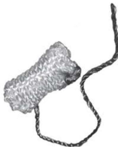
Fig. 1: Dental Cell tampon.

T-test, the Exact Fisher and Chi-Square tests (Values of p \leq 0.05 were considered significant).