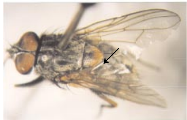
Figure 1. M. stabulans (Apex is yellow).

Muscina Stabulans (Fallen, 1817): During this study, 143 cases (58 female and 85 male) of this species were captured from central regions of Tehran. Tibia and the end of femur are yellow and 4th vein curved in this species. Scutellum in apex is yellow or light brown. The eyes have no hair. Length of the body is 8–9 mm and little bigger than house flies (Figure 1).