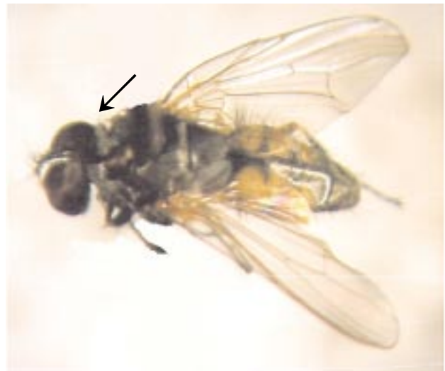
Figure 4. F. canicularis (1–3rd segments of abdomen is yellow).

behaviors and abdomen color especially on backside which is completely black in F. scalaris . It is yellow in F. canicularis (Figure 4).