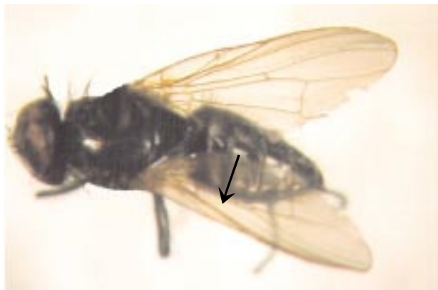
Figure 2. F. scalaris (Segment of abdomen is dark).

the inferior of tibia of mid leg, there is a bump with small teeth and in females parafacial has no hair. Length of body is 6–7 mm (Figure 2, 3).