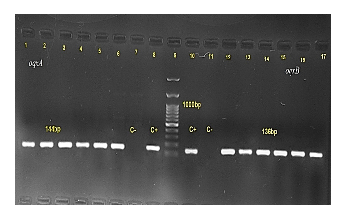
Figure 3. Amplification of oqxA and oqxB Efflux Pump Genes by PCR Assay. Lanes 1-6: oqxA gene positive-clinical strains of K. pneumonia (band: 144 bp), Lanes 7 and 11: negative control ( Escherichia coli ATCC25922), Lanes 8 and 10: positive control ( Klebsiella pneumonia ATCC 700603), Lane 9: DNA Ladder 100 bp, and Lanes 12-17: oqxB gene positive-clinical strains of K. pneumonia (band: 136 bp).

pneumoniae isolates was to cefotaxime (100%) and ceftazidime (100%), followed by gentamicin (63%), and the lowest level of resistance was to colistin (13%) and chloramphenicol (6%). In another study conducted on 100 isolates of K. pneumoniae, the antibiotic resistance was reported as follows: aztreonam (56%), meropenem (20%), gentamicin (36%), ciprofloxacin (53%), cefotaxime (56%), Colistin (0%), cefotaxime (64%) and tetracycline (50%).<sup>27</sup> In the current study, the resistance to colistin, cefotaxime, trimethoprim, norfloxacin, ciprofloxacin, chloramphenicol, gentamicin, and kanamycin was 61.81%, 44.54%, 25.45%, 21.81%, 19.09%, 11.81% 10.0%, and 9.09%, respectively. The results of the antibiotic-resistant rate in the current study were similar to other studies, except for colistin. However, in some cases, the resistance to the studied antibiotics was less than the present study, which can be due to the type and number of samples, the time and place