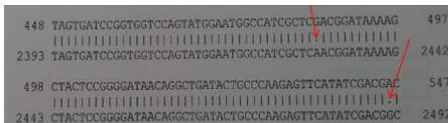
Fig. 2. Schematic representation of a mutation in 23S rRNA genes in online clustalW2 software. The image of both mutations is shown in positions 2431 and 2491.