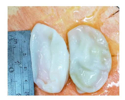
Fig. 3 Gross examination showed two removed cysts

sheep-breeding countries, such as Iran [5]. The lung is the second most affected organ [3], and the most common site of lung involvement is the lower lobe. In the present case, two cysts were found in the upper and middle parts of the right lung. In general, the clinical manifestations of CE vary, depending on several factors, such as the involved organ and size of the cyst [6]. The disease should be differentiated from mycoses, benign cysts, abscesses, malignant or benign tumors, and caviar TB [3].